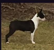
Aust Ch Bostonwood Ooh La La "Chase"