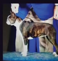
Ch Aust Bostonwood Mscongeniality "Lilly"