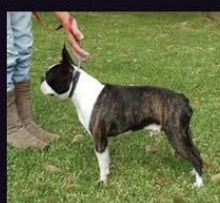
Aust Ch Boston Attitude Love On The Rocks (Imp France) "Rocky"