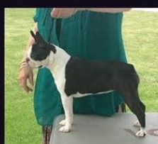
Aust Ch Bostonwood Beta Think Twice "Ruby"