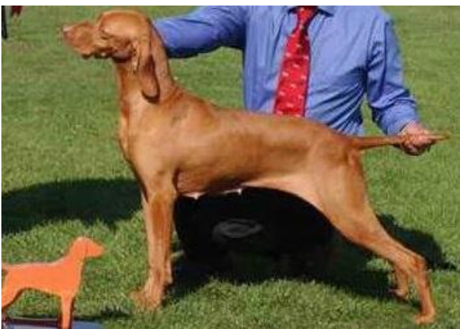
Ch Abbiestar Grand Marnier ET