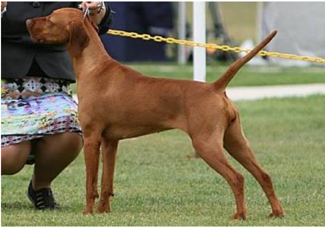
Ch Heiderst Scarlet Witch