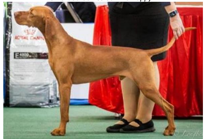
Ch Graebrook Rebel Withouta Cause