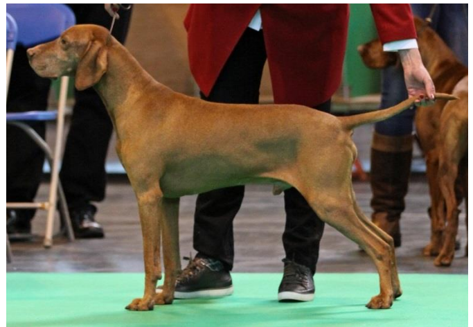
Ch UK Sh Ch Hanafor The Xecutioner