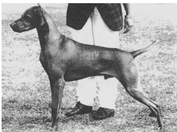
Gr Ch Hanafor Master Callaway