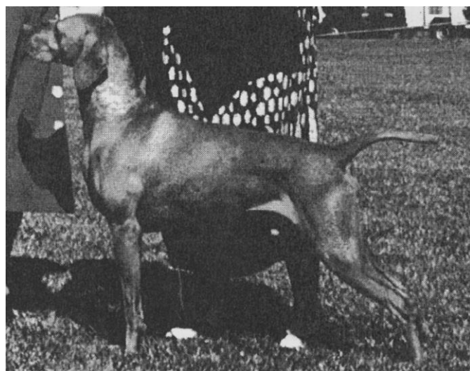
Ch Stubbs Red From Gardenway (IMP UK)