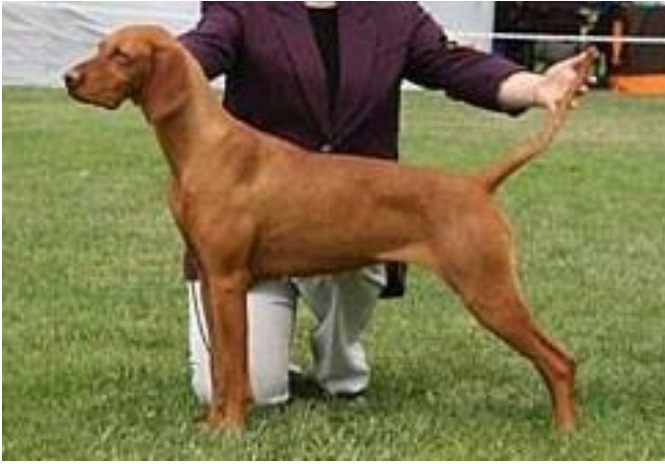
Ch Graebrook Breaking Point