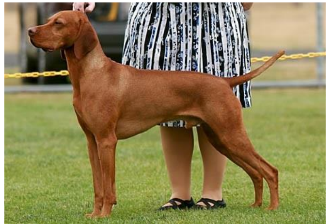
Sup Ch Graebrook Kausin Kaos TD ET