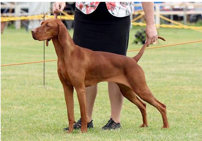
Graebrook Electric Mayhem