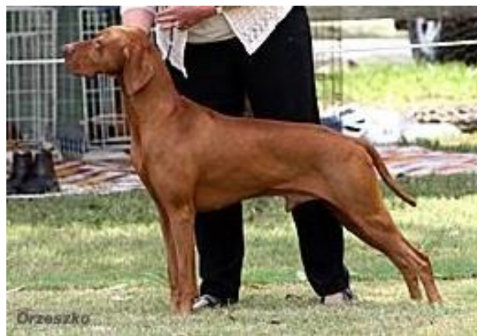
Sup Ch Hanabrit PontingThe Way (IMP UK)