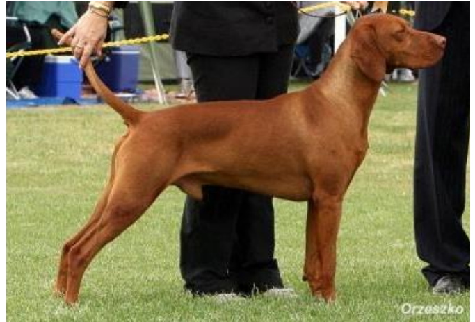
Ch Hungargunn Hyperno