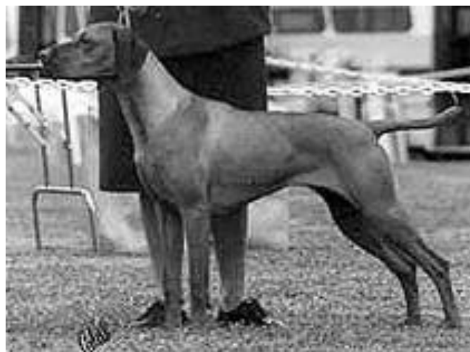
Ch Hanafor Lady Cavendish