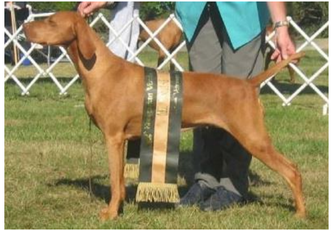
Ch Kimlise Isobella Ximenex