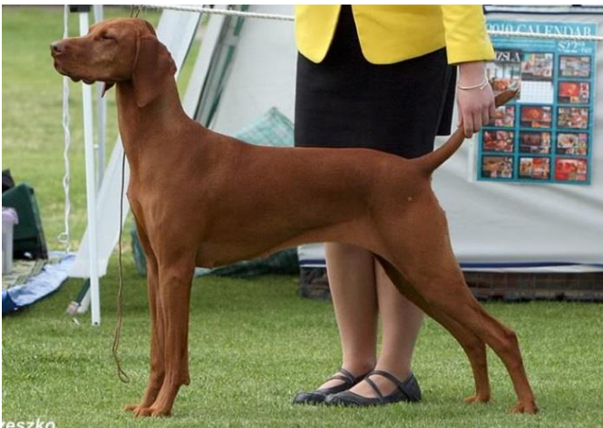
Gr Ch Graebrook Dzina Mzooni