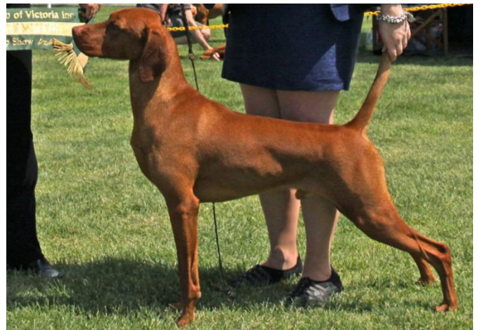
Ch Mastaregrand American Playboy (AI)