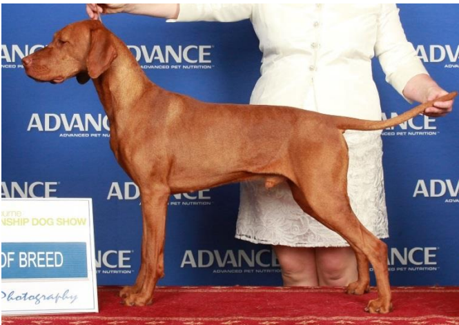
Sup Ch Graebrook Lord Of Scandal