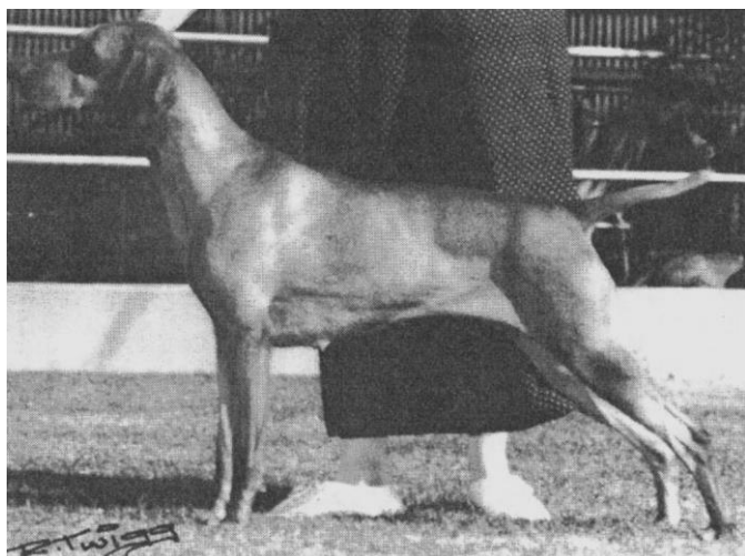
Ch Hanafor Lady Wychbold