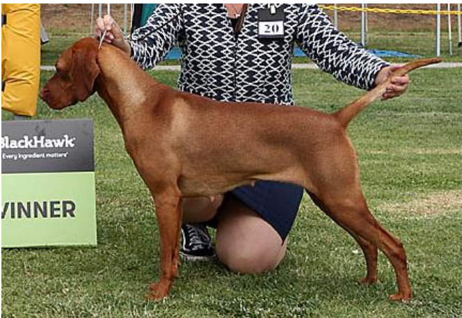
Ch Gamecall Making Waves