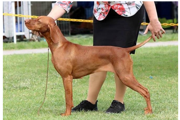
Ch Graebrook Colour Me Happy