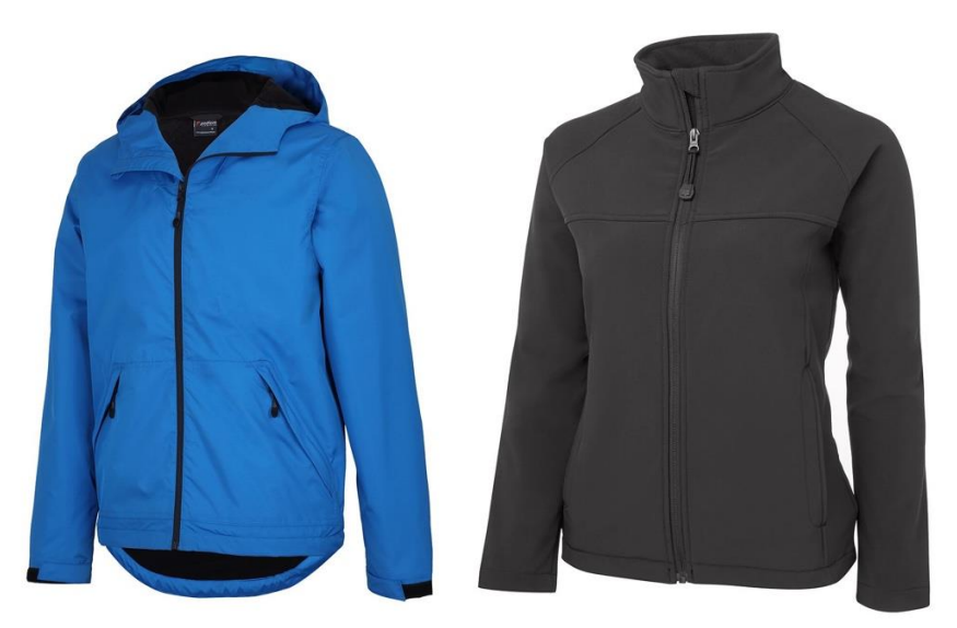
Jackets are examples only.