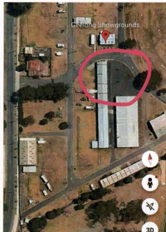
Basecamp will be at the Motor Museum with parking in the front.