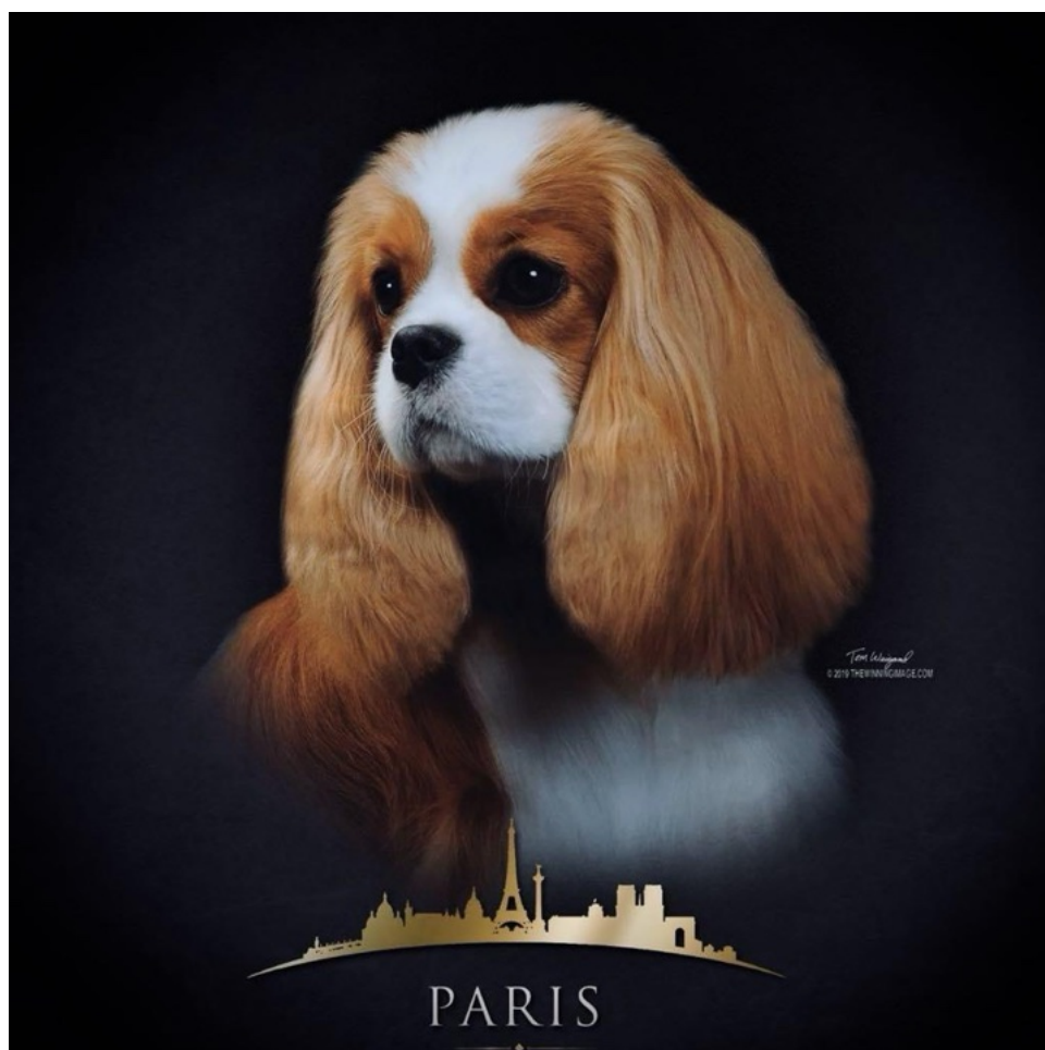
CKCSC, AKC Ch. Orchard Hill Charge it to Dad.

Having spent a life in dogs as a breeder and exhibitor, I truly appreciate the opportunity to study purebred dogs from inside the ring. I started judging Cavaliers in 2011. I have judged at specialty and all-breed shows, and in the U.S. and U.K.