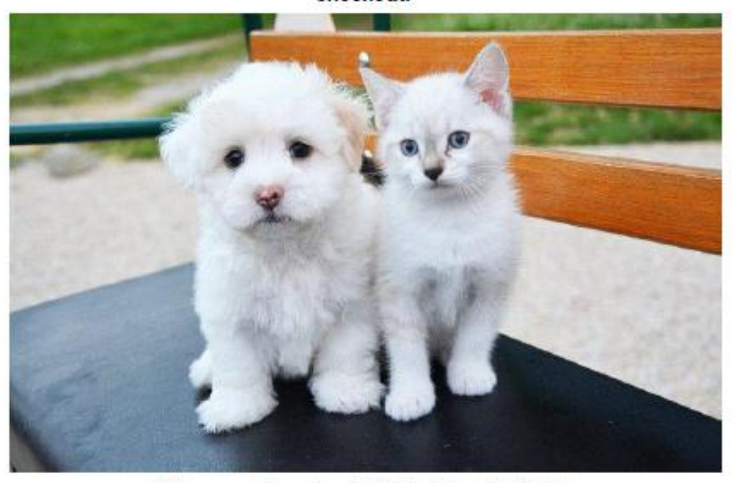
Like us on Facebook @EyeEnvyAustralia

As always free shipping for all orders over $50. Plus we now offer a special 10% discount for orders over $250, add code: 10for250 at checkout.