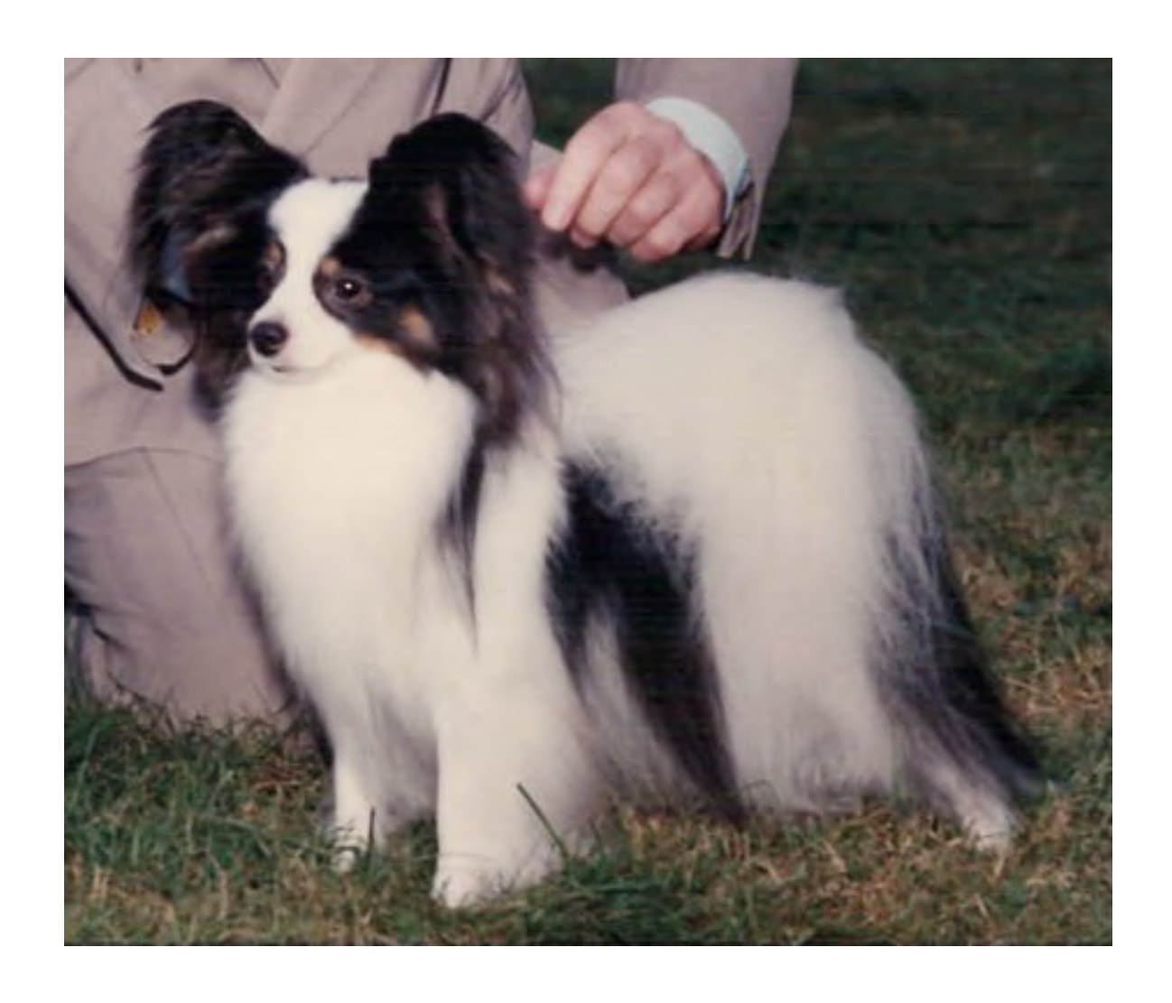
CH. LOTEKI SUPER NATURAL BEING