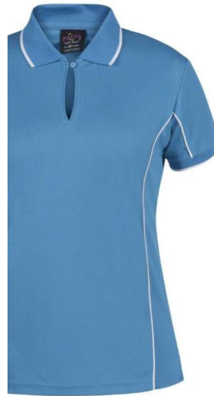
lt blue/ White –