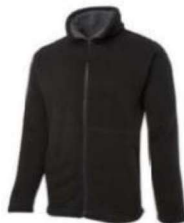
JB's Shepherd Jacket 3JS